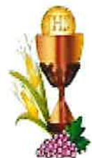
Most Holy Body and Blood of Christ